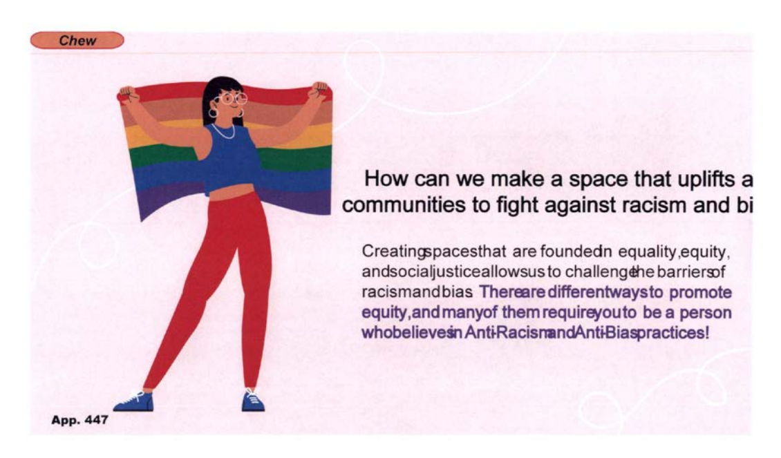
R.755. On the next slide, students are told to "brainstorm" what they "can do TODAY to promote equity." R.756.

the "ways to promote equity . . . require you to be a person who believes in Anti-Racism and Anti-Bias practices." R.755.